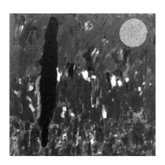
Opening Reception: Thursday 6th February, 7-9pm